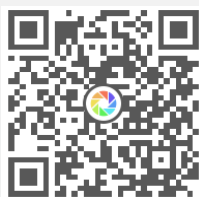
The website for The 9 th GRubbs Symposium

The website for The 9 th GRubbs Symposium is now live. Please register to participate in the Symposium via the website. For other information, please stay tuned to the official website and the Shenzhen Grubbs Institute public account.