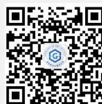
The public account for the Shenzhen Grubbs Institute