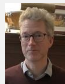
Robert B. Grubbs