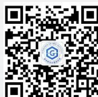
The public account for the Shenzhen Grubbs Institute