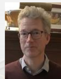
Robert B. Grubbs