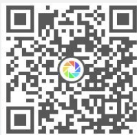
The website for The 9 th GRubbs Symposium

The website for The 9 th GRubbs Symposium is now live. Please register to participate in the Symposium via the website. For other information, please stay tuned to the official website and the Shenzhen Grubbs Institute public account.